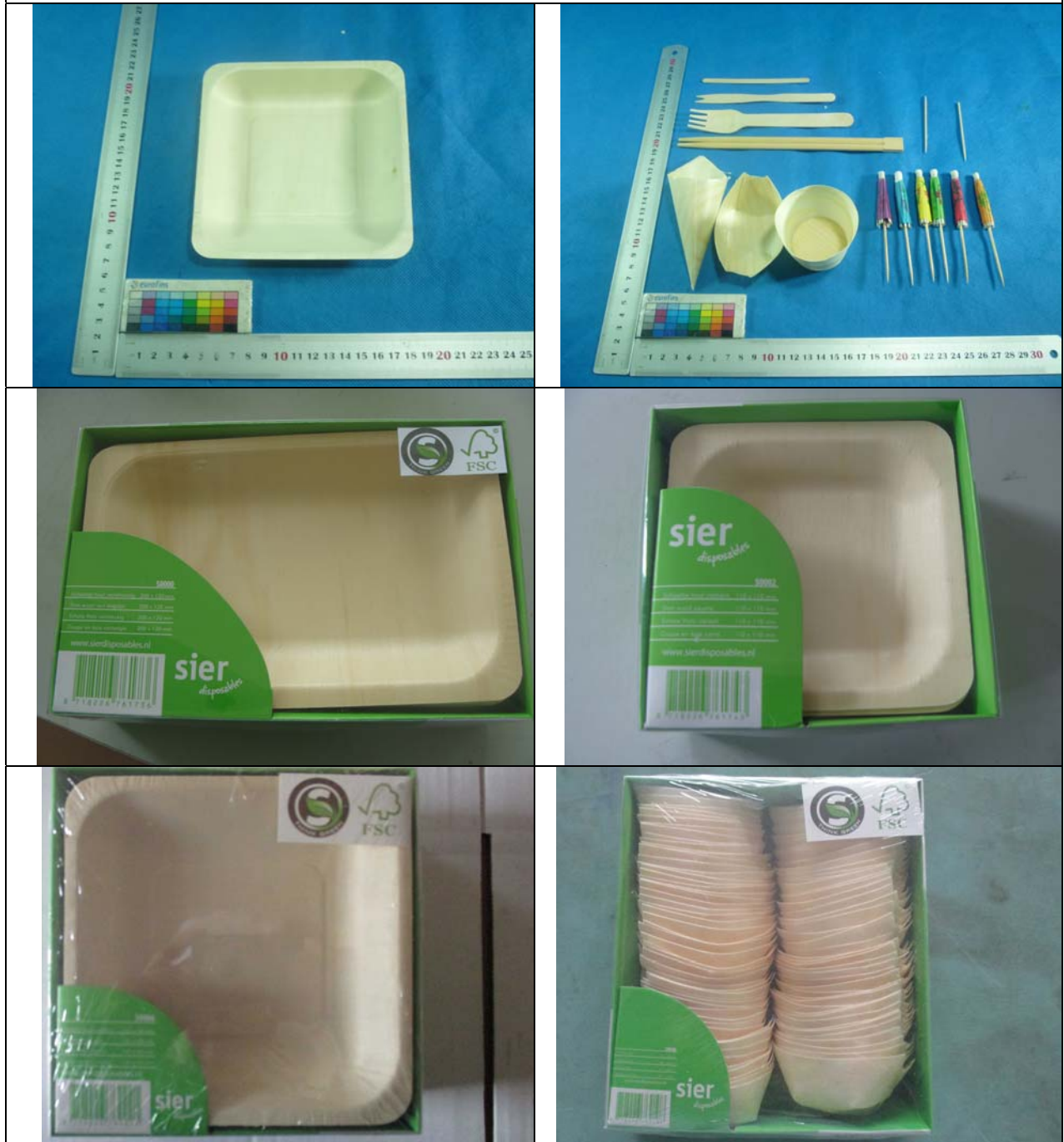
Photo Attachment WOODEN DISPOSABLE ITEMS